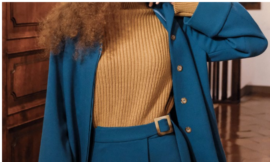
TRIESTE JACKET | DOPPIA CREPE 100% WOOL